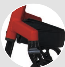
Concealed adjustment options