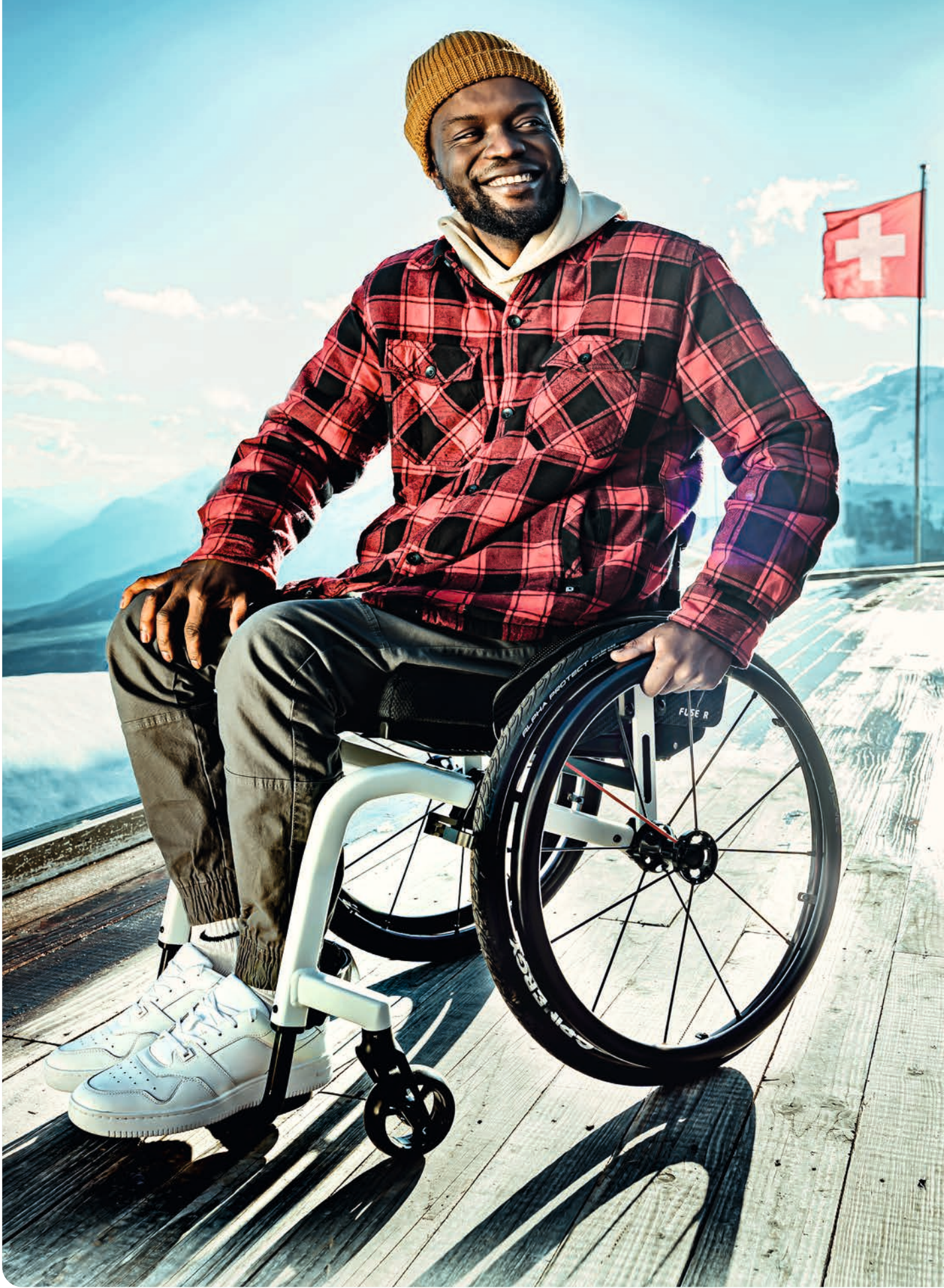
PICTURED: FUSE R